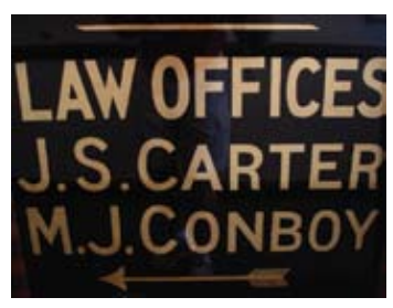
Original law firm sign that hung at its first office in Cohoes above Calkins Drug Store in 1920.