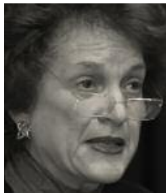
Hon. Judith S. Kaye