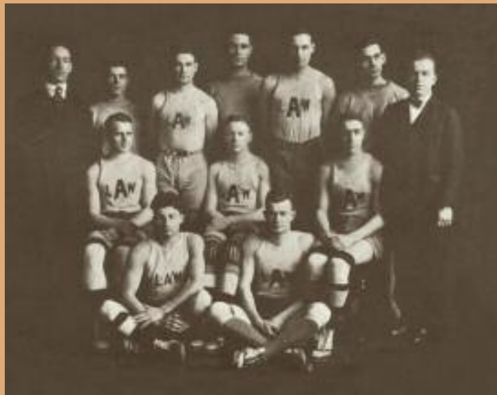
1921-22 LAW Men

The team collapsed for the next two seasons, finishing 5 wins-18 losses and 3 wins-9 losses. While the line-up suffered the typical losses of a college team—primarily loss of graduates and academic ineligibility—the real problem came when the city of Albany's school board voted to close its