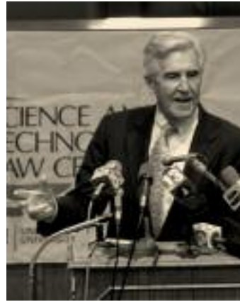
N.Y. State Senator Bruno

The Science and Technology Law Center received a $120,000 grant from the N.Y. State Senate to develop the nation's first Master's of Science in Legal Studies focused on technology transfer.